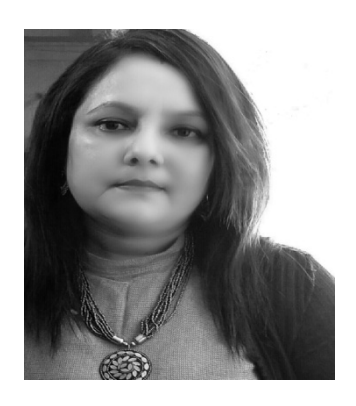
Head of the Department

Some significant achievements of the Department include several published research studies on social issues, completion of research projects and organization of workshops and seminars of national standards/levels.